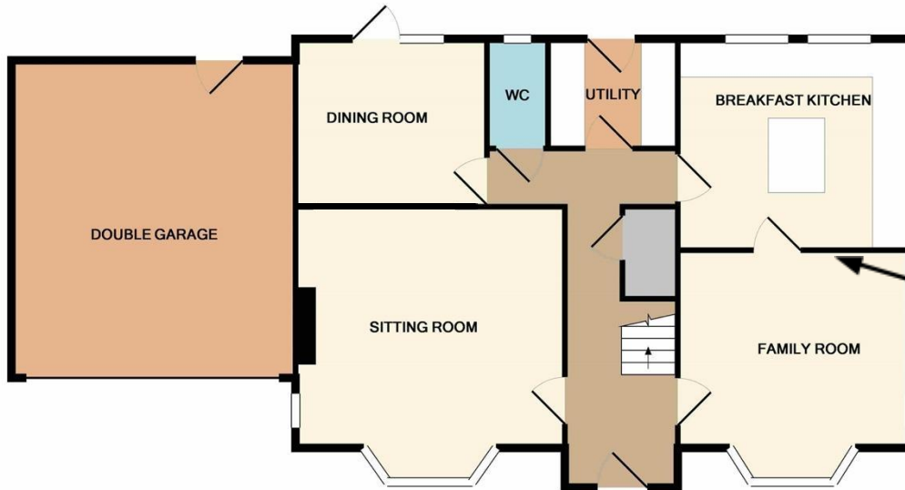
GROUND FLOOR APPROX. FLOOR AREA 1187 SQ.FT. (110.3 SQ.M.)